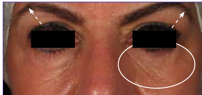
After 3 treatments