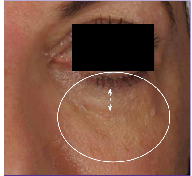
Three weeks after one treatment