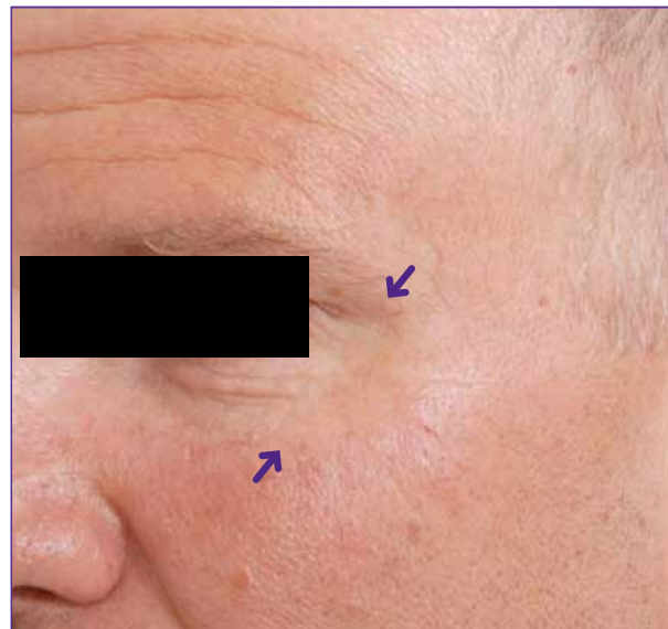
Immediately after treatment