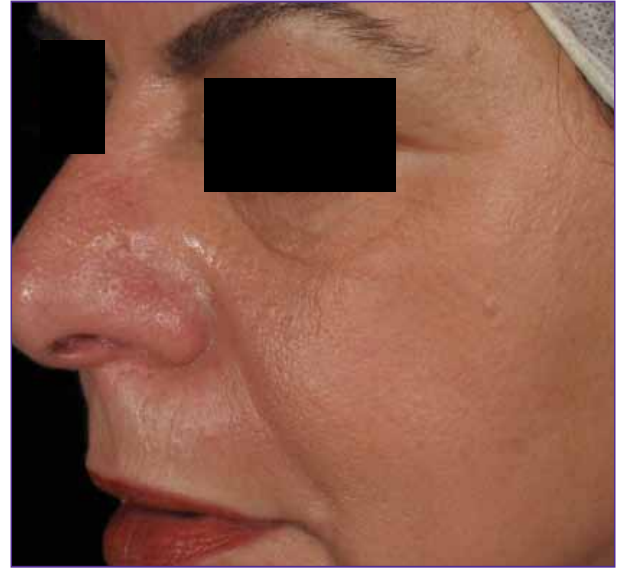
After 3 treatments