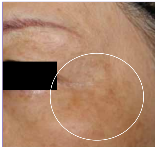
After 6 weekly treatment