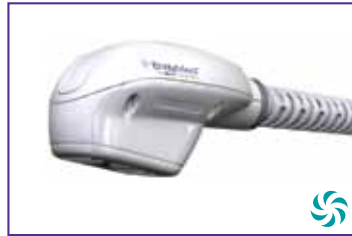
3DEEP® Body Contouring Handpiece