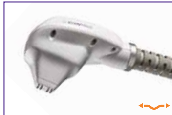
3DEEP® Facial Tightening Handpiece