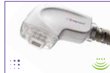
3DEEP® Fractional Skin Resurfacing Handpiece