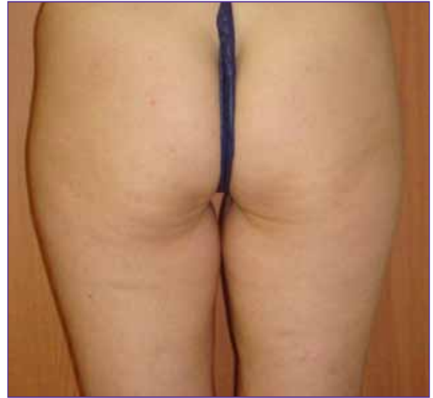
8 months follow up