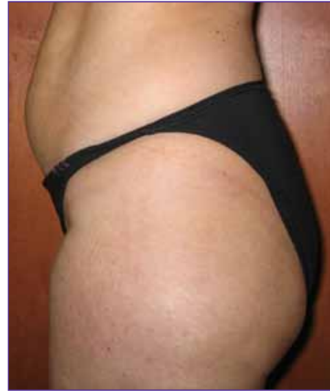
6 months follow up