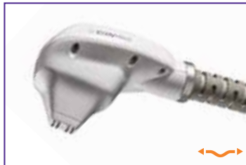
3DEEP® Facial Tightening Handpiece