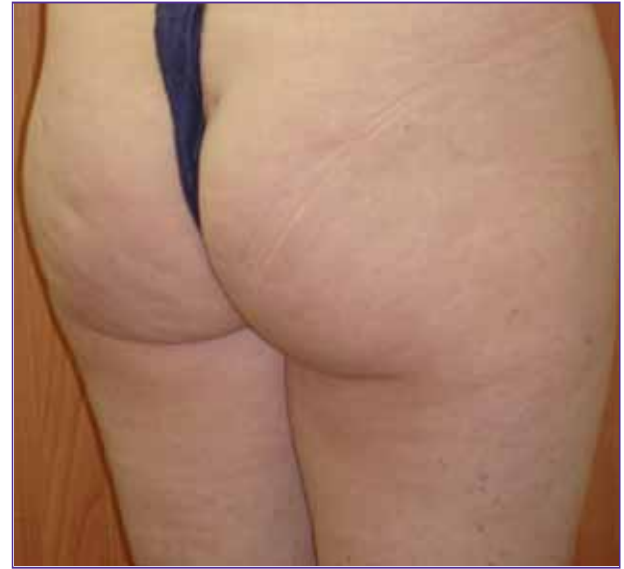
5 months follow up