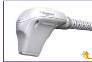
3DEEP® Body Tightening Handpiece