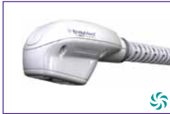
3DEEP® Body Contouring Handpiece