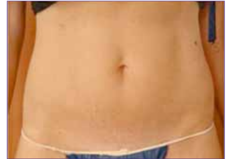
9 months follow up