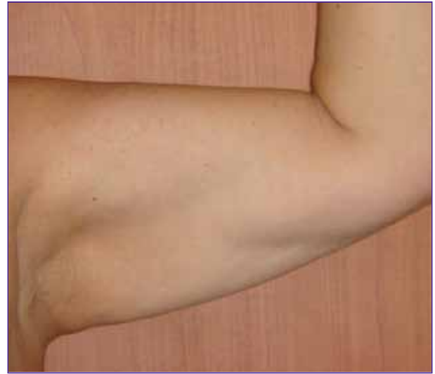
6 months follow up