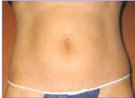
After tx. series