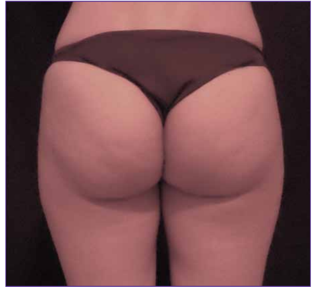
After six treatments